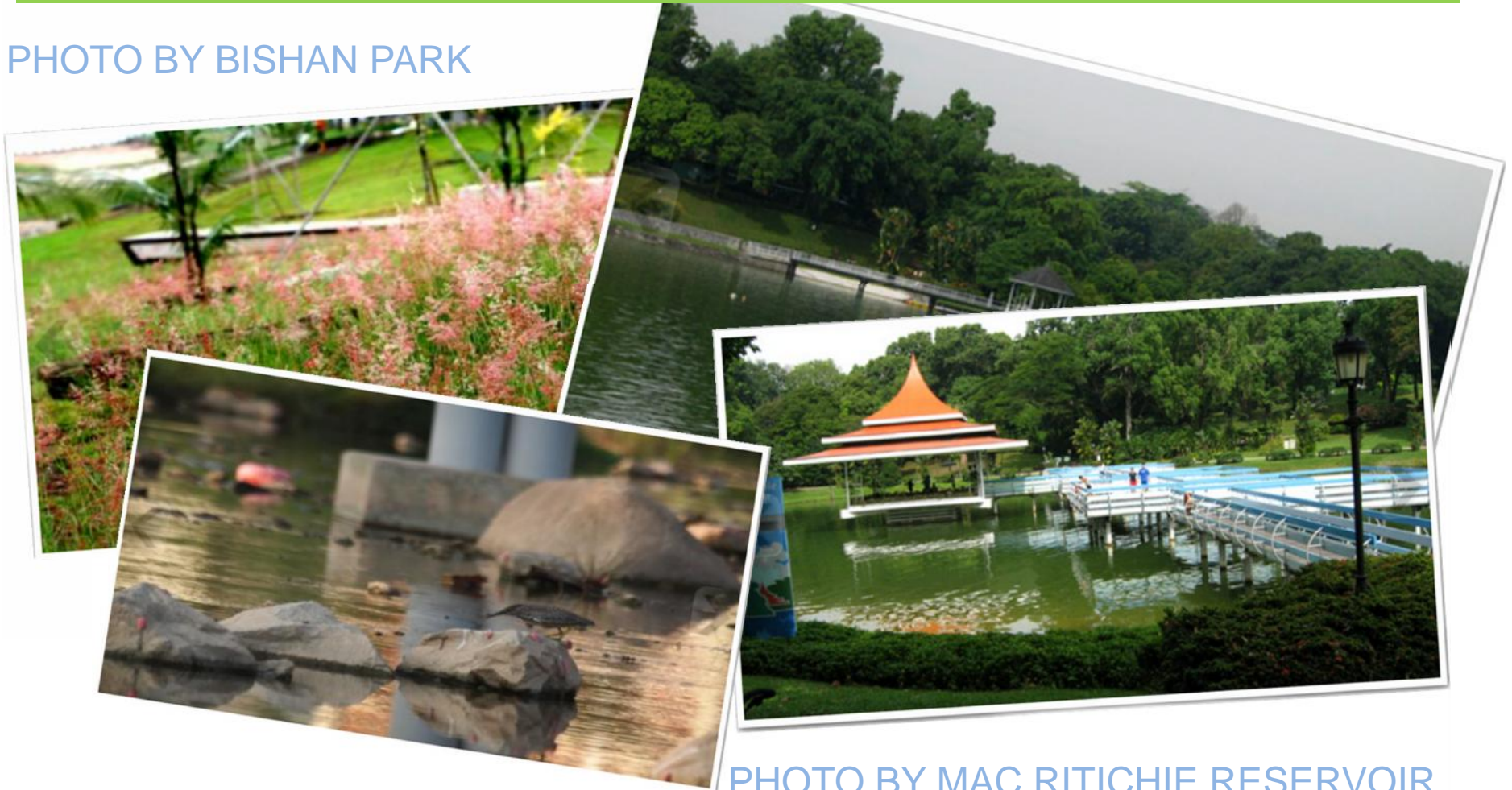
PHOTO BY MAC RITICHIE RESERVOIR

While every reasonable care has been taken in preparing the contents of this property summary, the developer and Knight Frank agent cannot be held responsible for any inaccuracy